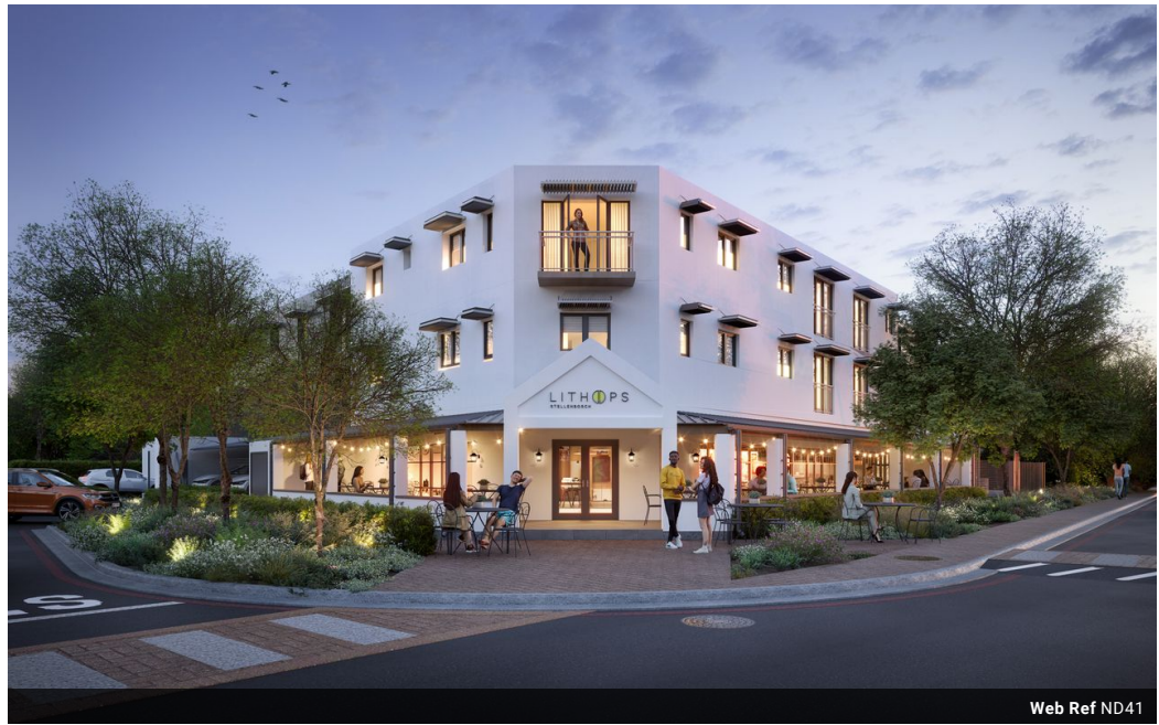
Web Ref ND41