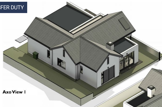
Axo View 1