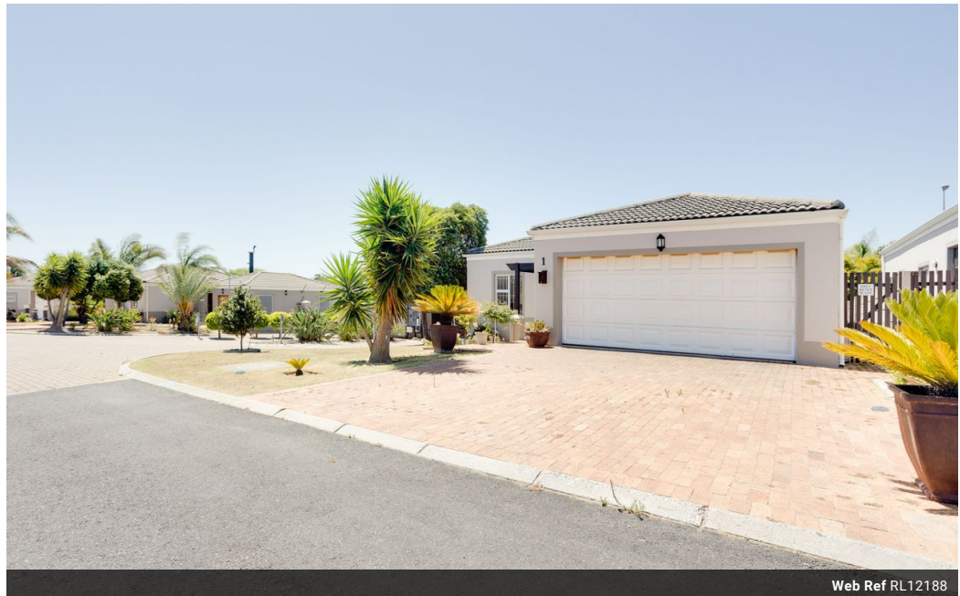
Web Ref RL12188