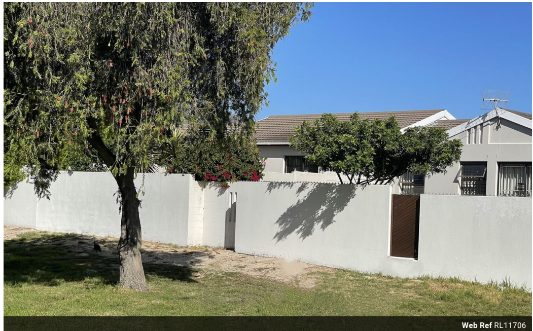
Web Ref RL11706