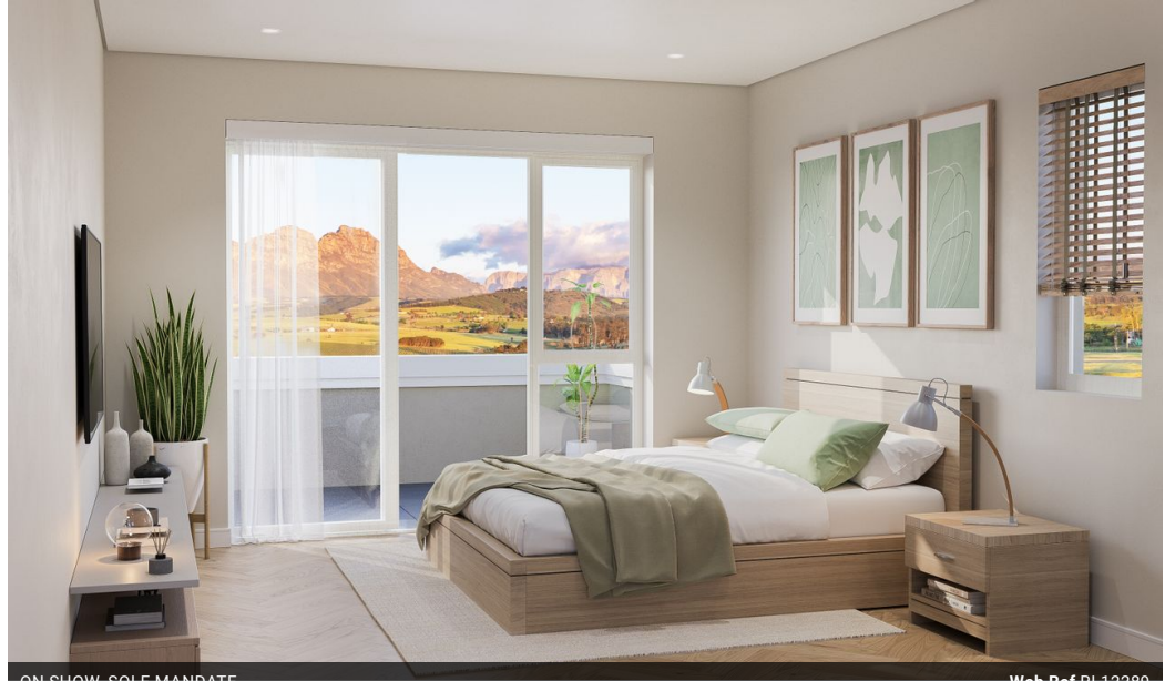
ON SHOW, SOLE MANDATE