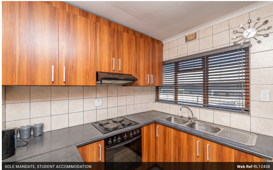
SOLE MANDATE, STUDENT ACCOMMODATION