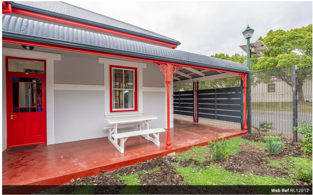
Web Ref RL12012