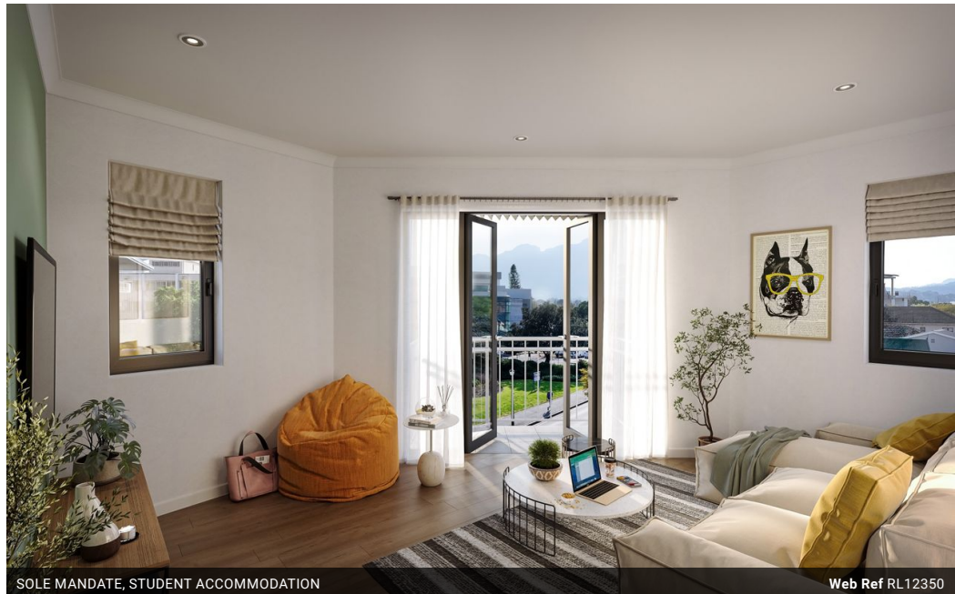
SOLE MANDATE, STUDENT ACCOMMODATION